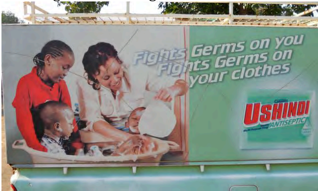
Interesting soap advertisement on a truck. Mother and daughter are bathing her younger brothers [one naked, the other still has his clothes on] in the same tub at the same time.