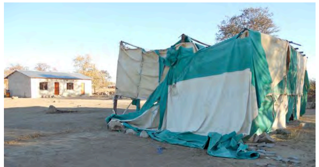
New block-tin roof church on left, old canvas, airy church on the right. God has been good.